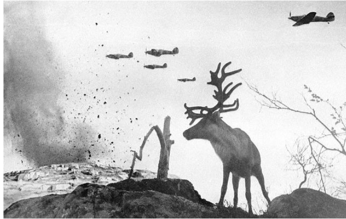
"Shell shocked deer" - Murmansk 1942

This photograph is a composite of three different pictures. Yevgeny took a picture of the British Hurricanes on loan to the Russians, then a picture of the shell exploding on the far left of the shot. Followed by one more image this time that of a deer. He then merged them together before Photoshop was even invented!